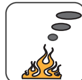
Low Smoke Emission IEC 61034-1&2 EN 50268-1&2/NF C32-074