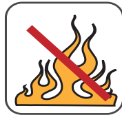
Flame Retardancy NF C32-070-2.1(C2) IEC60332-1-2/EN50265-2-1