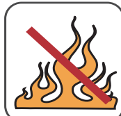
Fire Resistance IEC 60331 /NF C 32070-2.3(CR1)