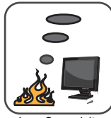
Low Corrosivity IEC60754-2 EN50267-2-2/3 NF C 32-074